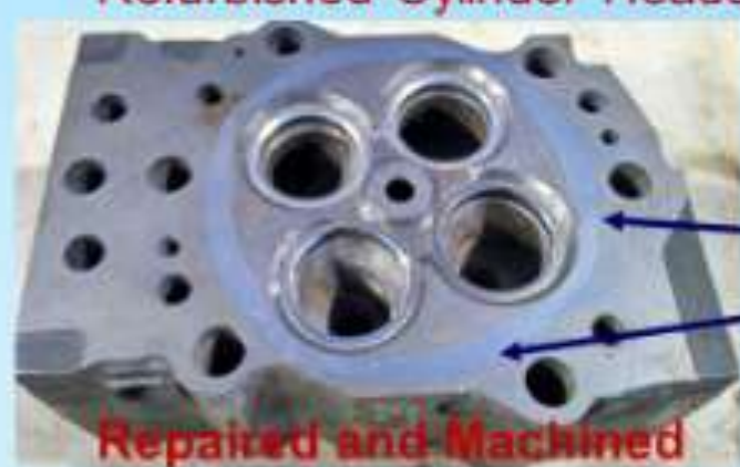
Repaired and Machined