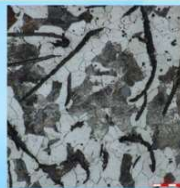
Material: Grey Cast Iron