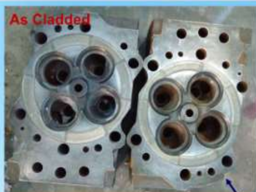
Refurbished Cylinder Heads